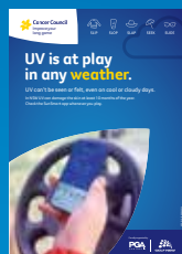
A4 UV is at play in any weather