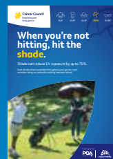
A4 When you're not hitting, hit the shade