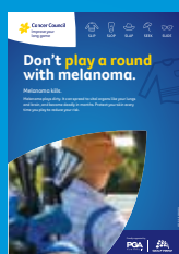
A4 Don't play a round with melanoma