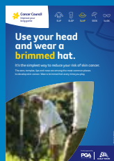
A3 Use your head and wear a brimmed hat