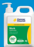
1L pump packs of SPF50 Dry Touch sunscreen for the stands