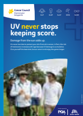
A3 UV never stops keeping score