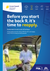
A3 Before you start the back 9, it's time to reapply