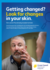
A4 Getting changed? Look for changes in your skin