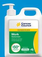
1L pump packs of SPF50 Dry Touch sunscreen for the stands