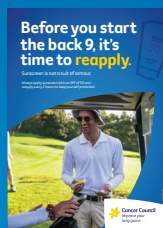
A3 Before you start the back 9, it's time to reapply