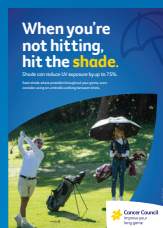
A4 When you're not hitting, hit the shade