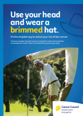
A3 Use your head and wear a brimmed hat