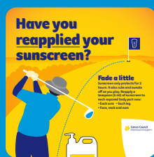
Sunscreen stands – 1st and 10th tee