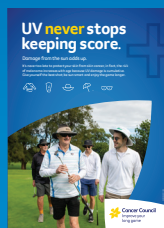
A3 UV never stops keeping score