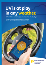
A4 UV is at play in any weather